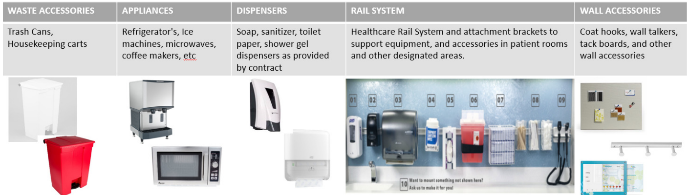
Figure #2 – Grady Standard Accessories