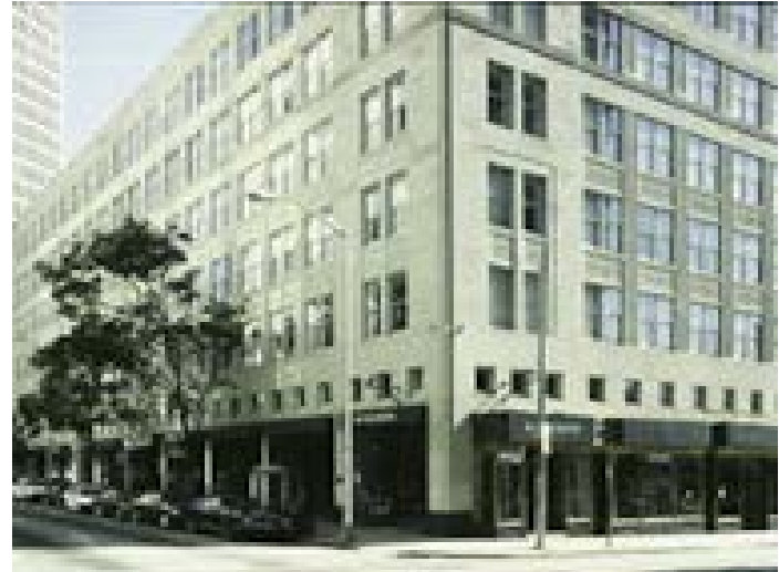
10 Park Place, Atlanta